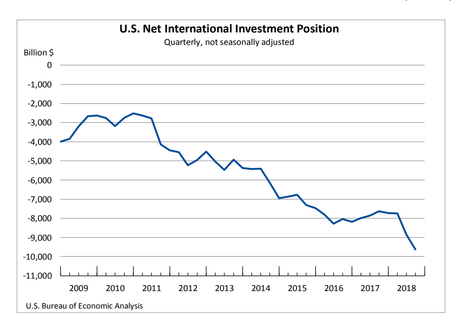
The $782.1 billion decrease in the net investment position also reflected net financial transactions of -$24.6 billion and net other changes in position, such as price and exchange-rate changes, of -$757.5 billion (table A).

The U.S. net international investment position decreased to -$9,627.2 billion (preliminary) at the end of the third quarter of 2018 from -$8,845.1 billion (revised) at the end of the second quarter, according to statistics released by the Bureau of Economic Analysis (BEA). The $782.1 billion decrease reflected a $135.5 billion increase in U.S. assets and a $917.6 billion increase in U.S. liabilities (table 1).