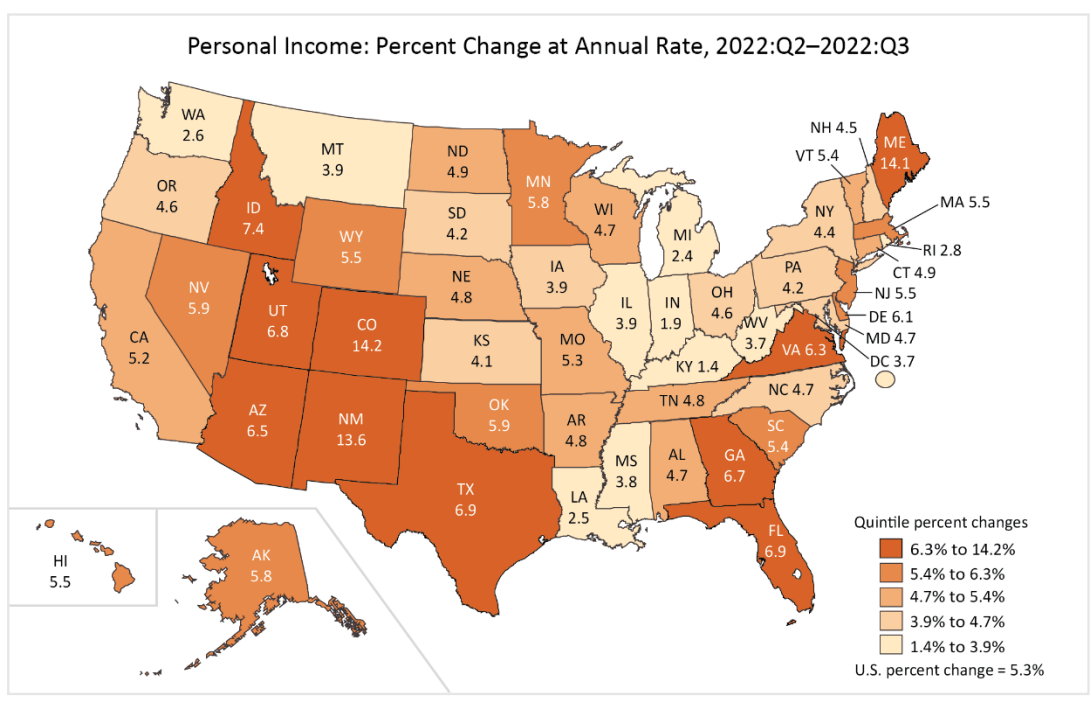
U.S. Bureau of Economic Analysis

Personal income increased in all 50 states and the District of Columbia in the third quarter, with the percent change ranging from 14.2 percent in Colorado to 1.4 percent in Kentucky.