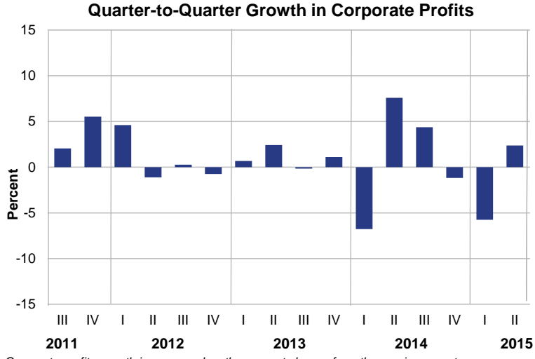
Corporate profits growth is measured as the percent change from the previous quarter.

Over the last 4 quarters, corporate profits decreased 0.5 percent.